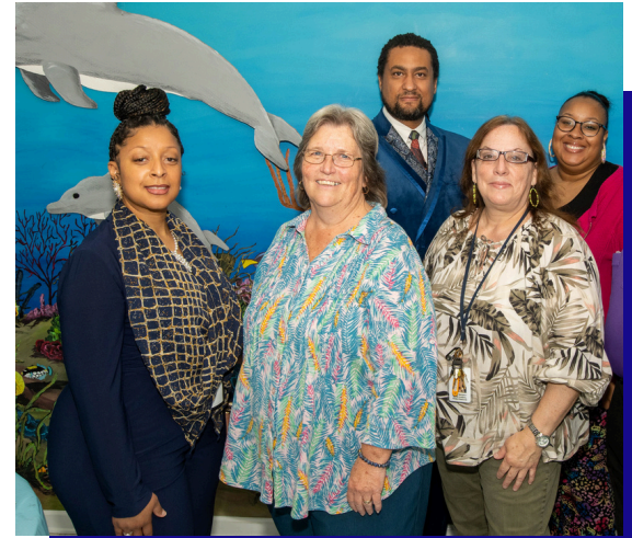
Pictured: LIFES Academy Staff

As of June 30, 2025 , LIFES Academy served 10 students. Average daily attendance was steady, with improved student participation noted across programs. The average number of absences was 2 per twenty days , with two students achieving perfect attendance.