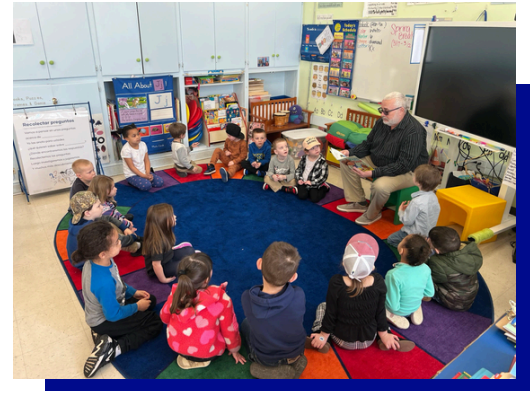
Pictured: Read Across America Week