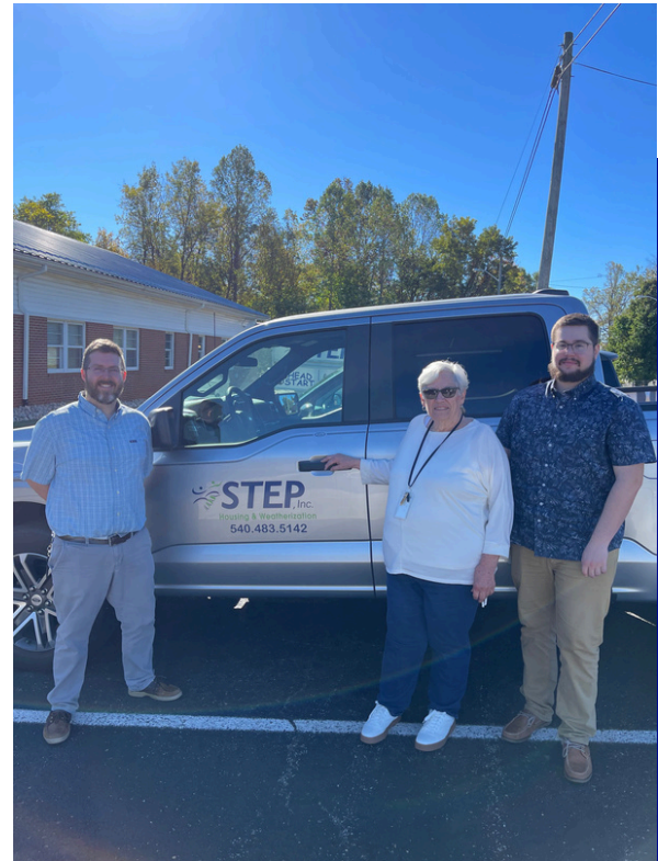
Pictured: STEP, Inc. Housing & Weatherization Staff

She now enjoys a consistently cool home, and so do her dogs. While she noted the new ASHRAE bathroom fan is a little loud, she said it's a small price to pay for improved airflow.