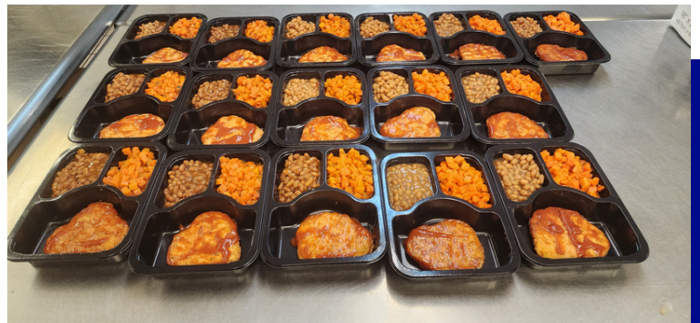
Pictured: Meals on Wheels Food Prep