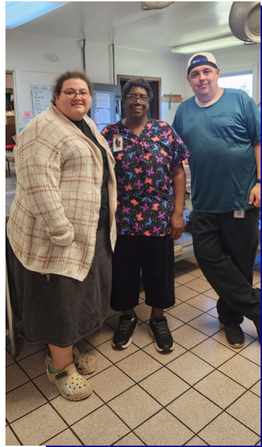
STEP, Inc. Franklin County Food Service Staff.