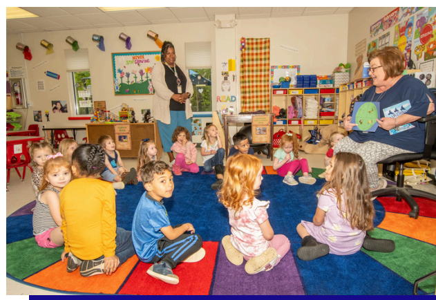
Pictured: Patrick County Head Start Classroom