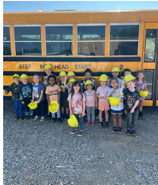
Pictured: STEP, Inc. Head Start Field Trip