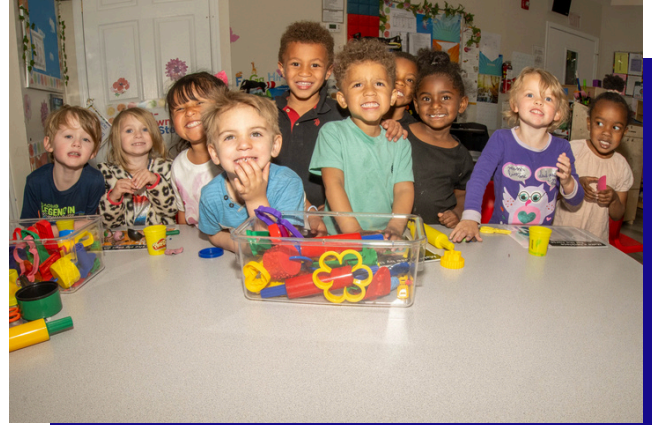
Pictured: Franklin County Head Start Classroom

Your extraordinary generosity has been the foundation of our ability to provide essential support during these challenging times. Your contributions go beyond mere financial assistance; they represent investments in our community's resilience and the hopeful future of our neighbors. We are truly grateful for your steadfast commitment to STEP's mission, and your passion fuels our efforts every day. Thank you for making a significant and lasting difference in the lives of those we serve.